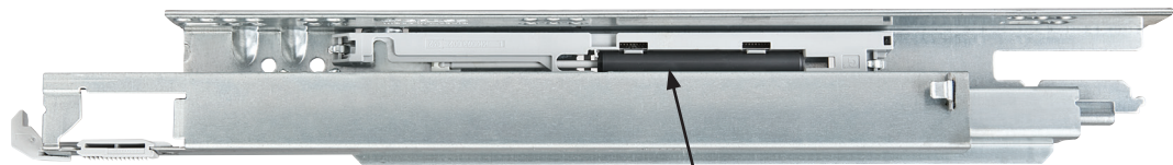
8mm liquid damper offers new closing technology.