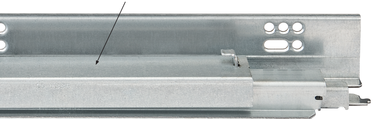
Abrasion resistant nylon rollers ensure smooth and even operation.