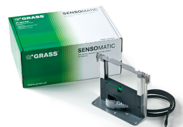
Sensomatic for handle-free drawers (Page 38)